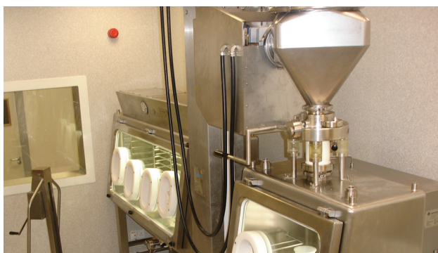
API Dispensing Suite Project managed by Hosokawa