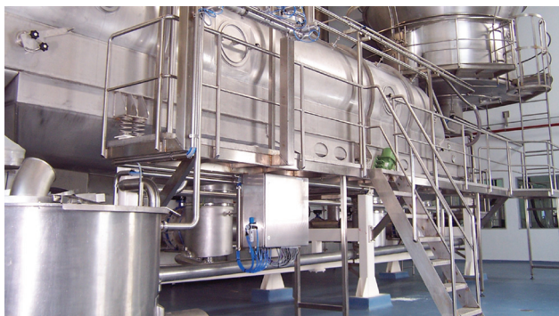
Spray Dryer and fluid bed dryer for instant whole milk